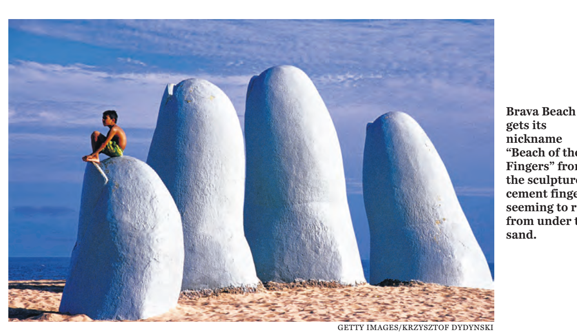
nickname "Beach of the Fingers" from the sculpture of cement fingers seeming to rise from under the sand.

Trump is not the only de- URUGUAY, Page M5