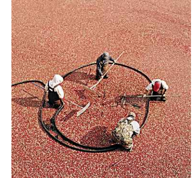
Cranberry bogs are a feast for the eyes at fall harvest. M5