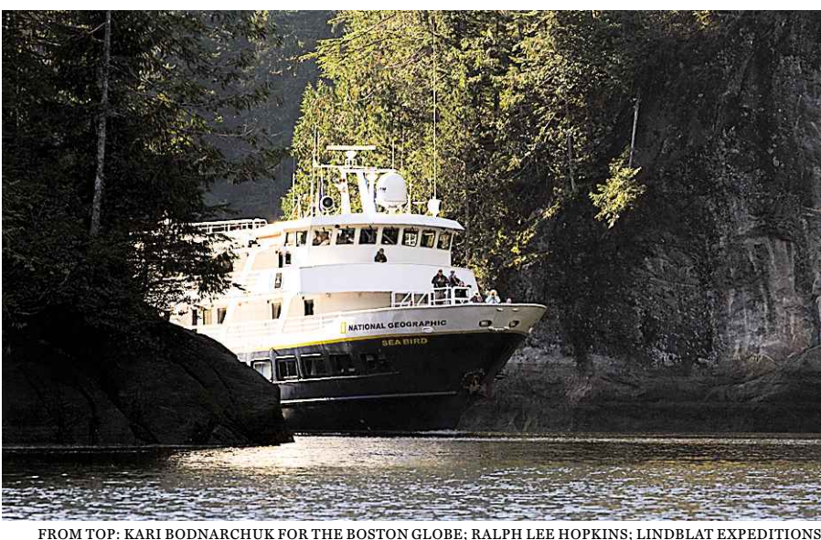
Cruise passengers on Alaska's Yanert Glacier; an orca group off Vancouver Island, British Columbia; a 62-passenger ship navigates an Alaskan narrow.