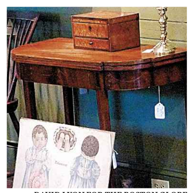
Antiques are a collective passion in tiny Woodbury, Conn. M5