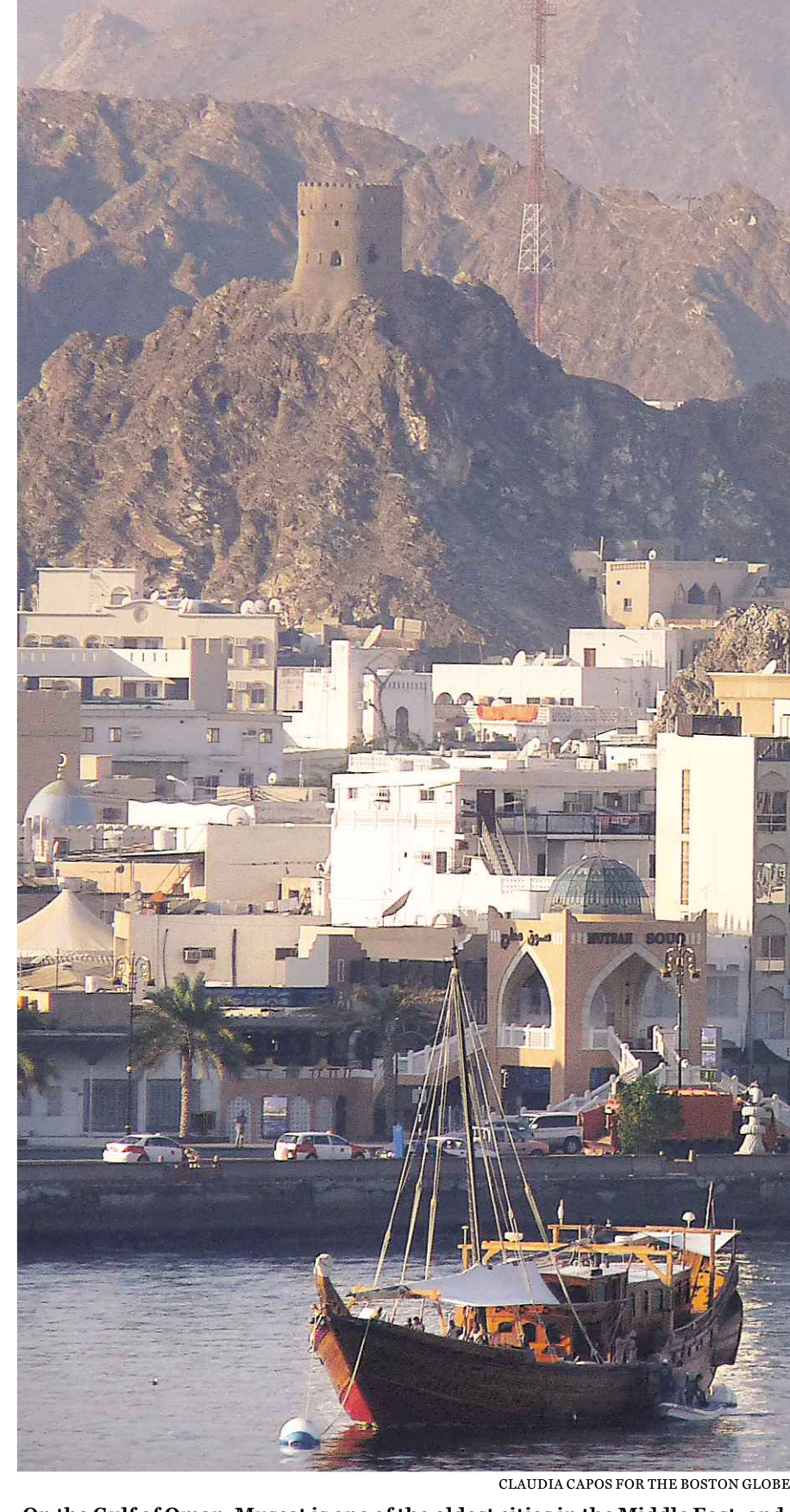
On the Gulf of Oman, Muscat is one of the oldest cities in the Middle East, and was an outpost for the kings of Hormuz in the 14th and 15th centuries.